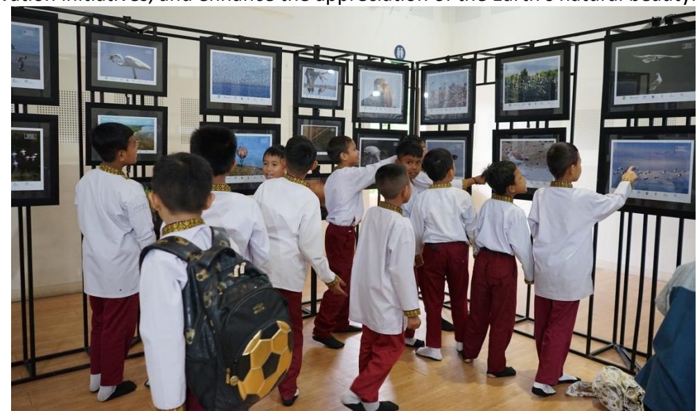
Picture 4. The participants viewed a photo exhibition at Multipurpose Hall of PT. Inalum.

The photo exhibition took place within the Multipurpose Hall of PT. Inalum Tanjung Gading, sharing the same space as the coloring contest. It was attended by a diverse audience, including the finalists of the photo contest, elementary school children who participated in the coloring contest, their teachers, and visitors to the 2023 WMBD activities ( Picture 4 ). This photo exhibition plays a crucial role in its capacity to introduce various wildlife, inspire conservation initiatives, and enhance the appreciation of the Earth's natural beauty.