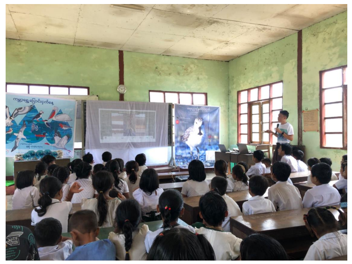
Photo 4: Presentation about the wetland ecosystem and six Ramsar sites in Myanmar