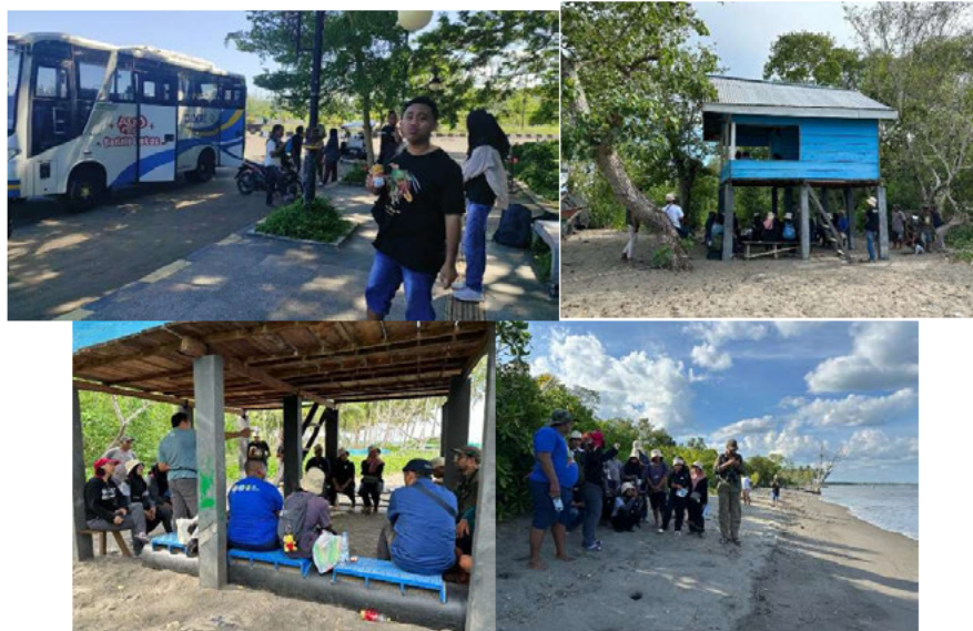
Figure 7. Day 1 Go to Kao Bay in North Halmahera, Discuss on the spot with local people, monitoring of migratory bird

The next day, migratory bird monitoring training was conducted. This activity took place in Kao Bay and lasted two days, from October 7 to 8, 2023, with 15 participants from various regions attending: Bacan, Tidore, Ternate, Soffi, and Tobelo.