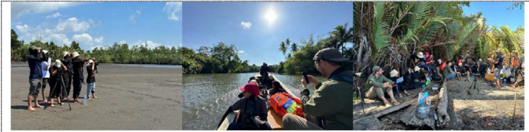
Figure 8. Day 2, monitoring of migratory bird