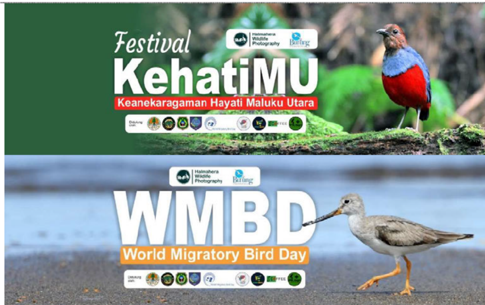
Figure 2. Poster on the stage

The photo exhibition ran for three days, from September 6 to September 8, 2023, at the Ternate City Landmark. Several bird mascots endemic to North Maluku were displayed as visitor attractions during the photo exhibition. The photographs on display depict migratory bird species as well as endemic birds from North Maluku.