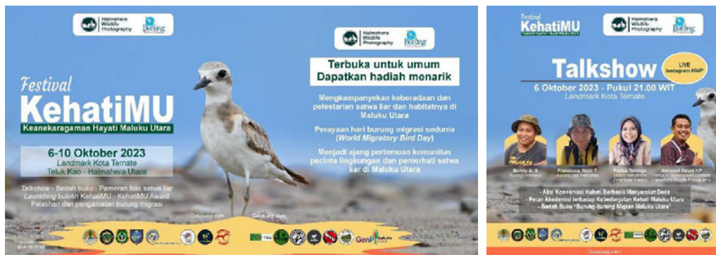
Figure 1. Poster in social media Instagram @halmaherawildlivephotography

Halmahera Wildlife Photography (HWP), in collaboration with Burung Indonesia, will host the “Fetival KehatiMU” (Keanekaragaman Hayati Maluku Utara/North Maluku Biodiversity) from September 6 to 8, 2023, with a variety of activities including a photo exhibition, talk show, launching of KehatiMU newsletter, KehatiMU Award, and migratory bird monitoring training.