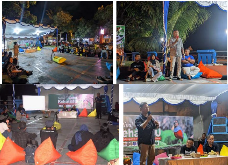
Figure 4. talk show, Head of Ternate Tourism Department, Director Exekutive of Burung Indonesia, and Expert Staff of North Maluku Governur.