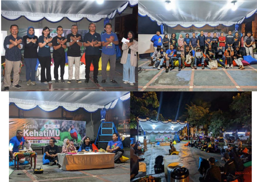
Figure 6. Talkshow

People from Ternate and Halmahera from various circles, including students, students (elementary, middle, and high school), academics, environmental activists, journalists, photographers, government, and the general public, attended the photo exhibition and talk show. Aside from that, the talk show activity was broadcast live via Halmahera Wildlife Photography's live Instagram to a total of 346 viewers from various regions in Indonesia.