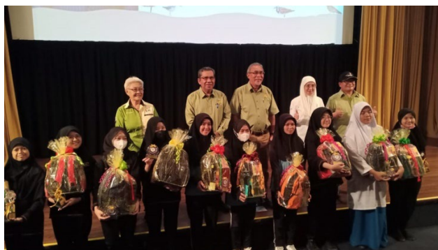
Drawing competition winners line up on launching day

Several photos by local birdwatchers were displayed alongside artwork at the exhibition hall in digital form throughout the event. The contributors shared their beautiful photos of migratory waterbirds during their annual southward migration through the flyway. Information sourced by the EAAFP website helped in further enriching the information on the celebration day shared with the public during the event. Apart from the library, other agencies and NGOs were also part of the exhibition by devising activities and display setups for their booths.