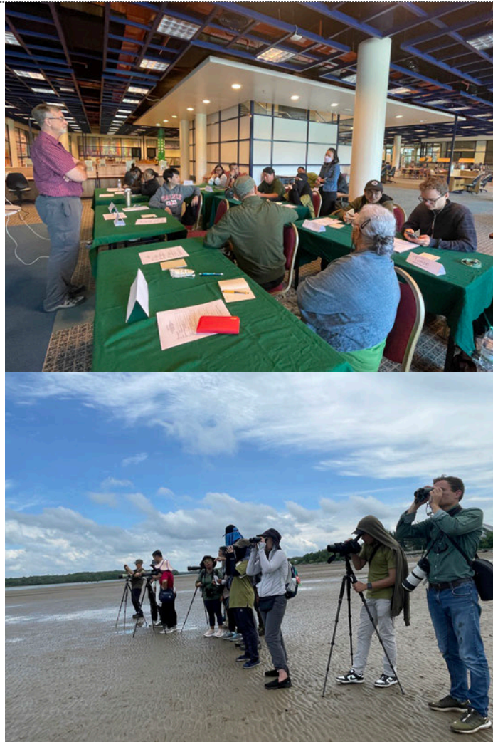
Shorebird workshop at the library and birdwatching at Buntal esplanade