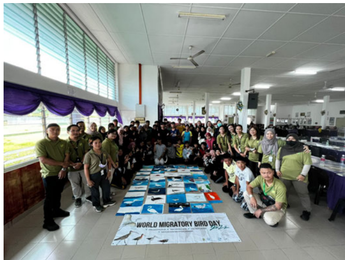
Group photo with students of SMK Sadong Jaya