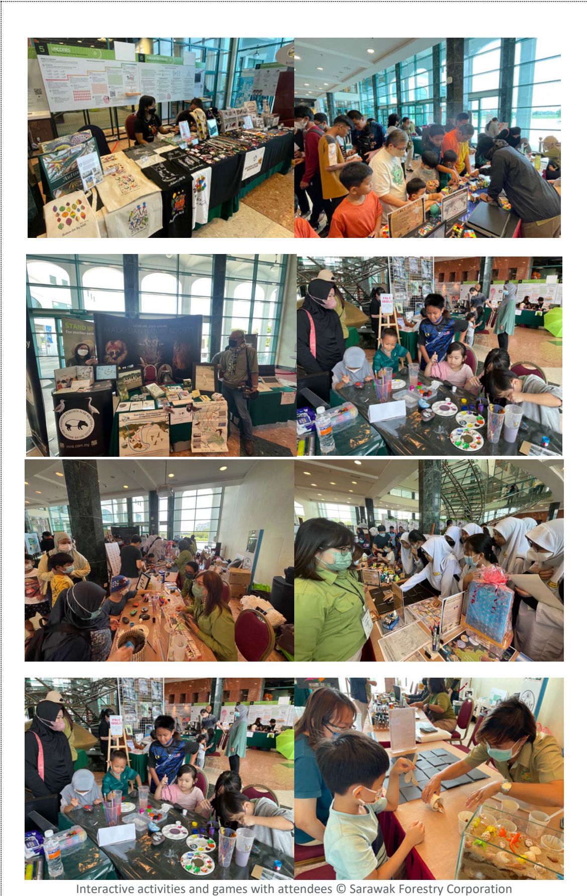
Interactive activities and games with attendees