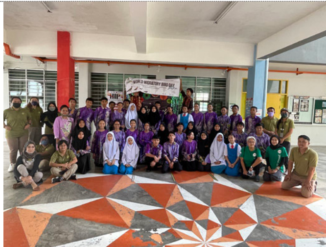
Group photo with students of SSM