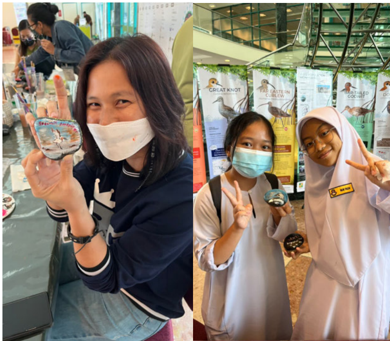
Public participating in booth activities