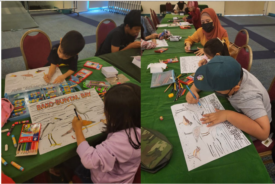
Colouring competition ongoing

Overall, the event was a great success. It served as a powerful reminder of the importance of informative and engaging content in efforts to promote migratory birds and their habitat. SFC hopes to continue to organise similar events in the future, to create a positive impact using networking and dialogue, social media campaigns, and art and crafts related to migratory birds.