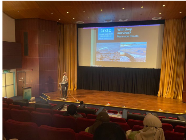
Talk by keynote speaker