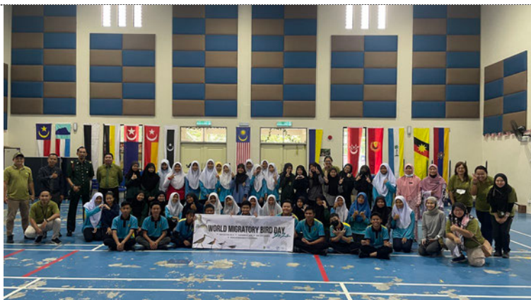
Group photo with students of SMK Sadong Hilir