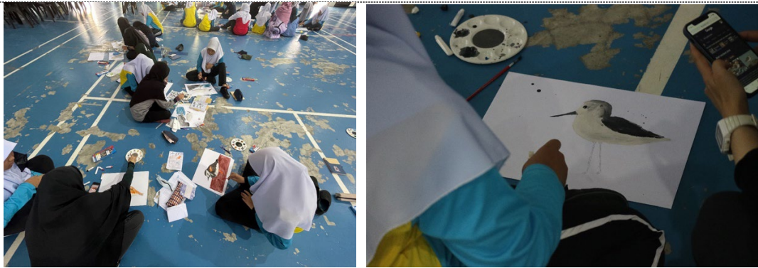
Drawing competition ongoing © Sarawak Forestry Corporation

Several key migratory shorebird species were selected for the theme, including the Chinese Egret, Spoon-billed Sandpiper, Far Eastern Curlew, Bar-tailed Godwit, and Ruddy Turnstone. With the medium of watercolour, students need to produce a painting within two hours of the time given. Their artwork will be displayed at the library during the whole week of WMBD, along with the announcement of winners. The top 10 paintings were selected from each school, and the top three were chosen for best art overall.