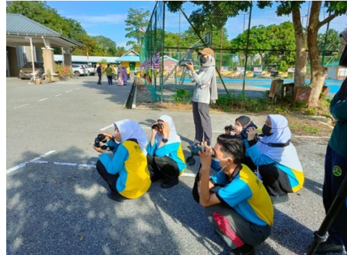
Presentation and birdwatching session with students