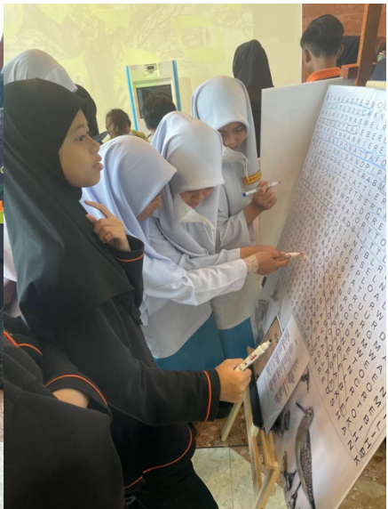
Interactive activities and games with attendees