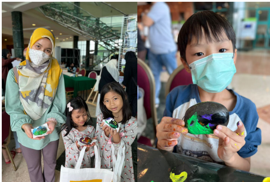
Public participating in booth activities