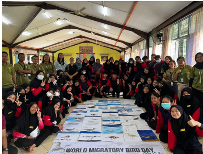
Group photo with students of SMK Santubong