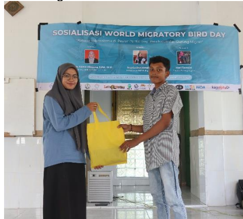
Picture 9. Best Participant