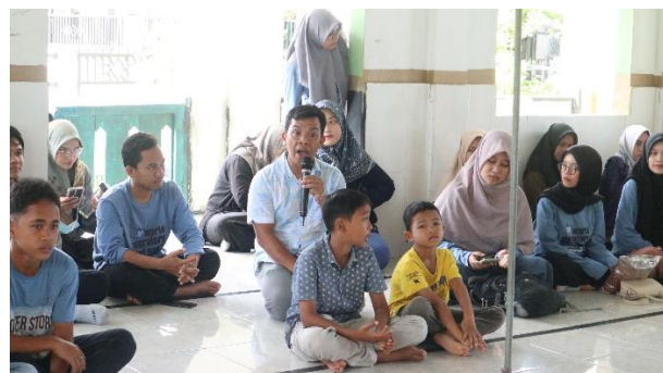
Picture 6. Second Presenter