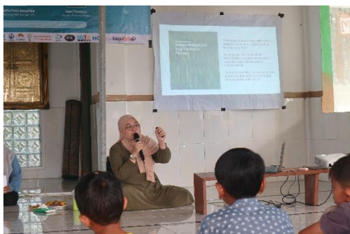
Picture 5. First Presenter