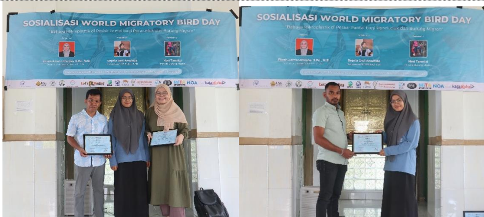
Picture 7. Presenter gift