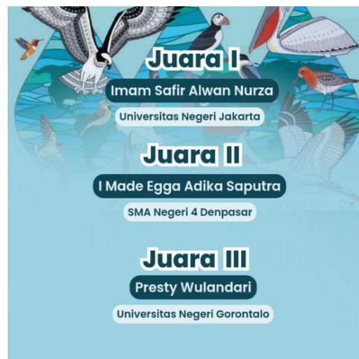
Picture 3. The winner with the best essay

The culmination of a series of activities held by the Aceh Bird Club was on May 20-21, namely campaign activities and Cleanup the river. This campaign was organized by the Aceh Bird Club in collaboration with the Biology Student Association, this activity was carried out on Saturday 20 May 2023 at 09.00-12.00 at the Peulanggahan village