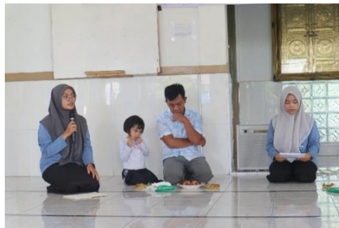
Picture 4. Opening Ceremony

This activity was attended by 50 participants from various backgrounds, students, bird watchers, and school students. The program was published in the university's online media, and published in several other online media, so that people who don't know about the dangers of microplastics to humans and migratory birds can read it. Participants were very enthusiastic to hear the explanation from the speaker. There were several series of activities during the campaign, namely: delivering materials, giving souvenirs, and giving prizes to the best participants. all campaign activity participants received certificates, souvenirs in the form of tumblers with an inscription " Protect Water for The Future of Migratory Birds and Humans " and received consumption. Apart from offline or in-person campaigns, the Aceh Bird Club also conducts an online campaign for WMBD 2023 activities through social media accounts and uses hashtags that have been determined by the committee.