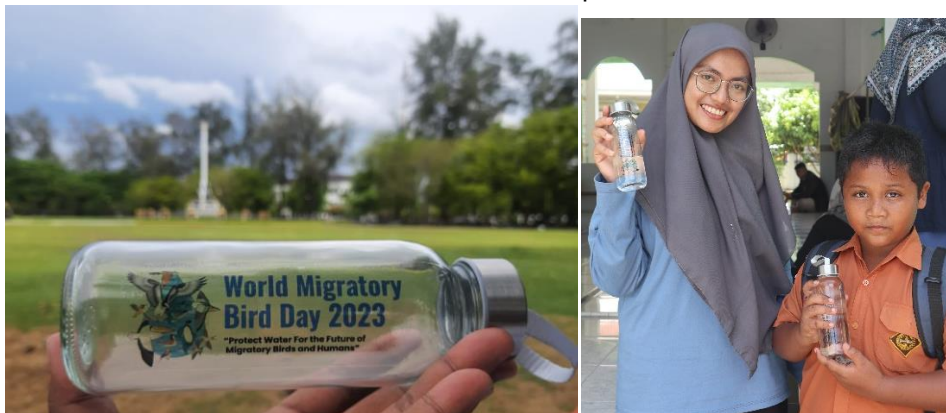
Picture 10. Souvenirs for all participants