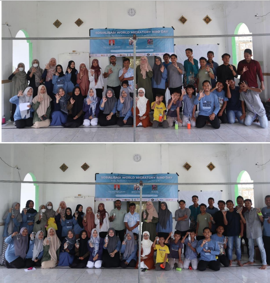
Picture 10. Closing Ceremony

Cleanup the river walk activity was the last activity in a series of WMBD 2023 activities which were held in Lampulo village, Banda Aceh on Sunday, May 21, 2023. The garbage collection activity started from 09.00-11.00, this activity was attended by 70 participants from various backgrounds such as students, university students, environmentalists, the public and some communities, the total amount of waste collected is 550 kg with an area of about 400 m long. This activity was also supported by the Banda Aceh City Environment Service and the Kuta Alam Police Chief. This activity was covered by various media, starting from university media (Detak press), local media (kataalpha.com, ajnn.net, dialeksis.com, rmlaceh.id, antarafoto.com, antaranews.com), and national media (okezone.com, Kompas tv), so that it can be read by the public and educate the public to protect the environment and dispose of waste in its place. During the activity along the river/beach, all participants also received