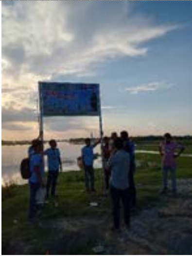
Billboard being set up at Shilaidaha Ghaat, Pabna