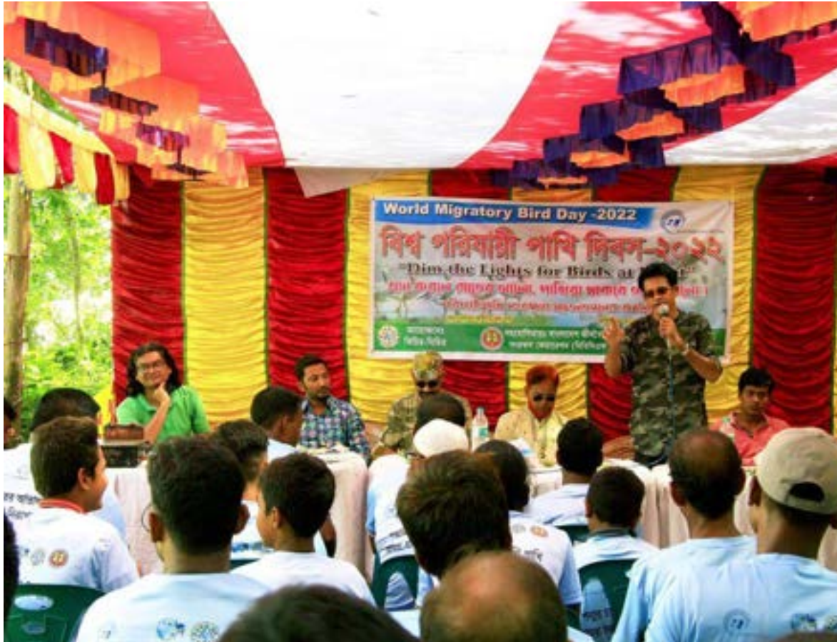
Local people on the discussion program wearing WMBD t-shirt

Partnership (EAAFP) organized a 2-days event in two local communities along Padma river in the districts of Kushtia and Pabna.