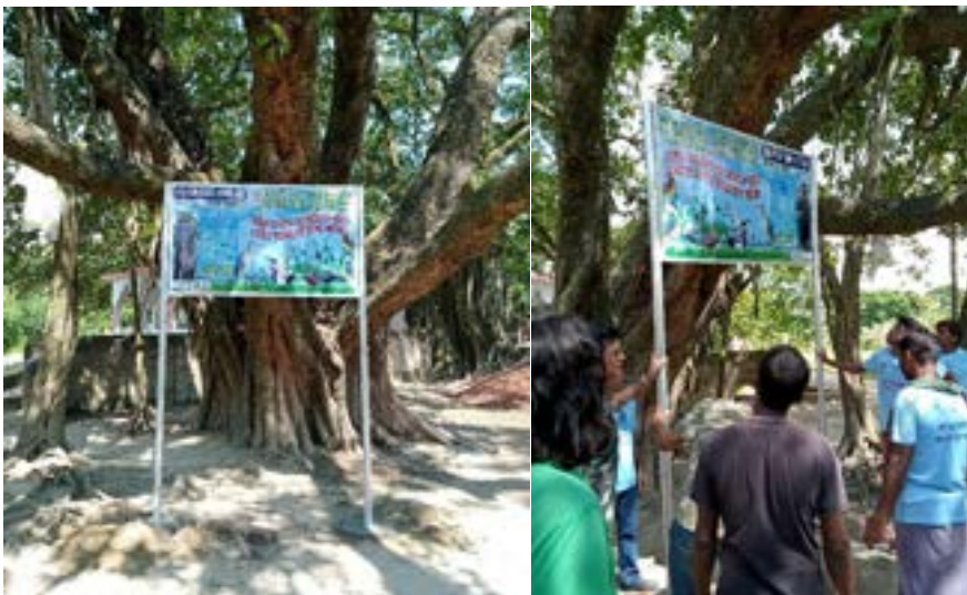
Billboard being set up at Horipur, Kushtia

After the program, a billboard was set up, with the participation of the community leaders and the local people, beside the path used for accessing boats, with the view that it will come into notice to anyone crossing the river towards the important migratory bird habitats.