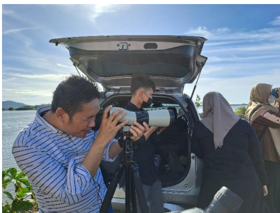
This birdwatching activity is a monitoring of migratory bird habitat as well as to introduce one of the migratory bird habitats in Aceh.