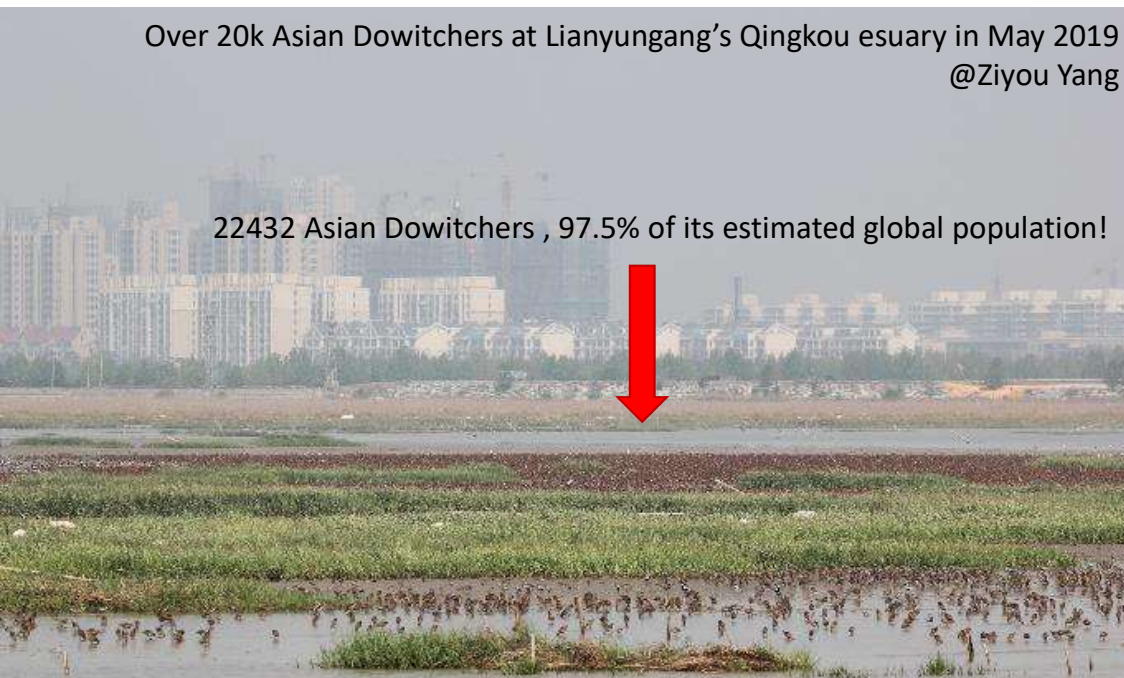
Close view of Asian Dowitchers @Luke Tang