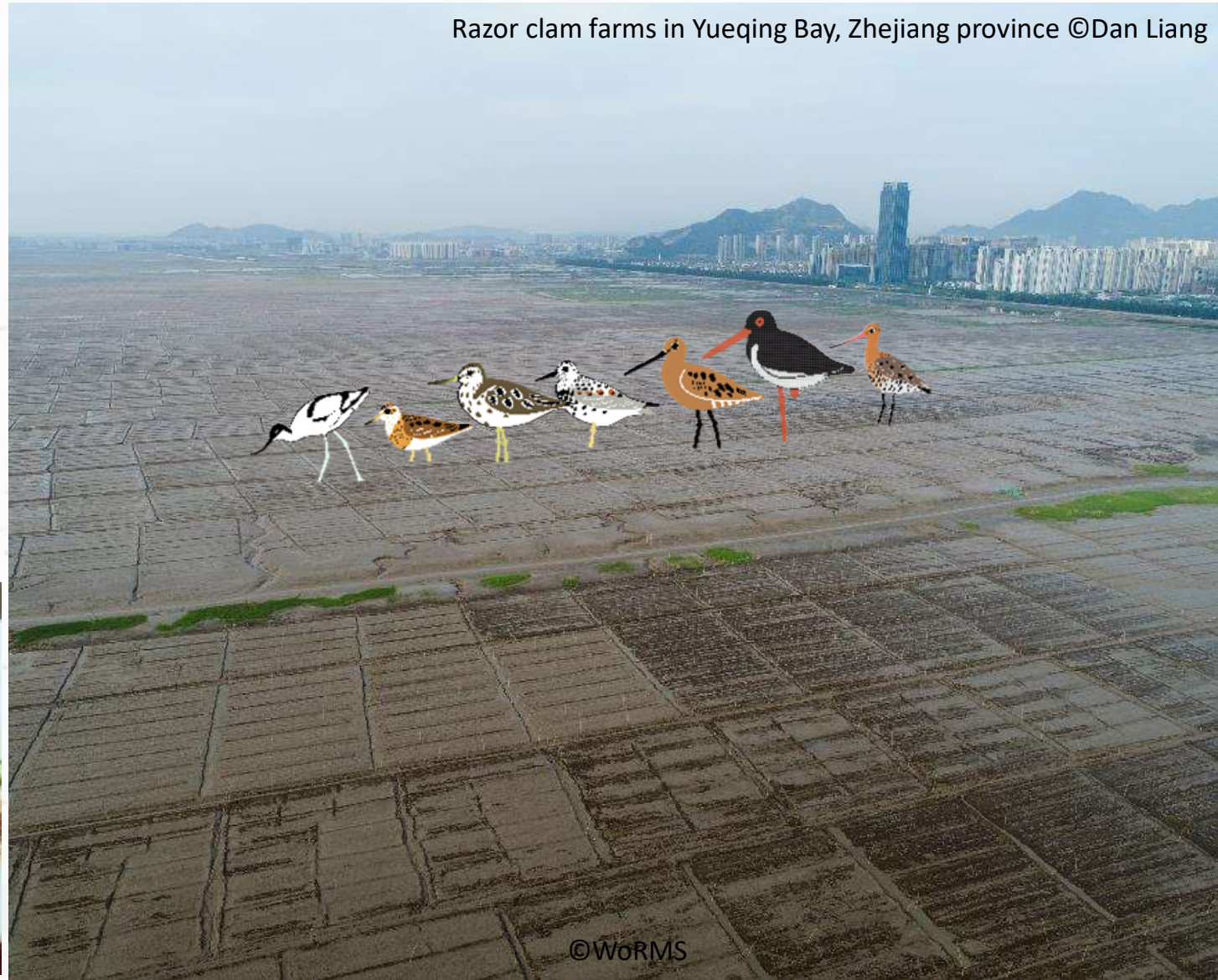
Razor clam farms in Yueqing Bay, Zhejiang province