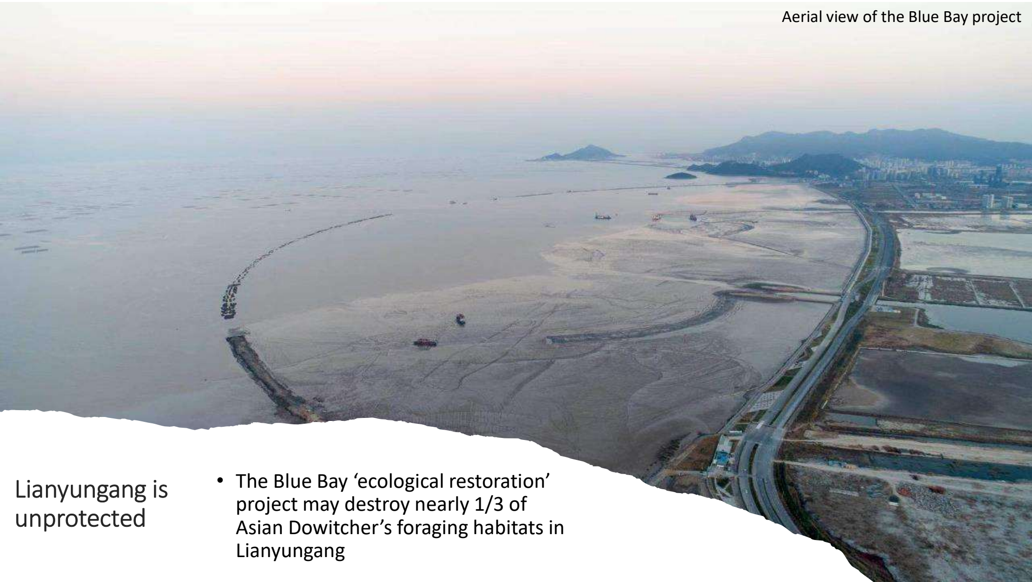
Aerial view of the Blue Bay project