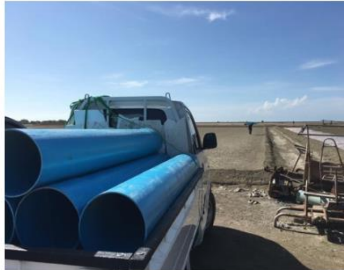
Installing underground pipe system at Pak Thale