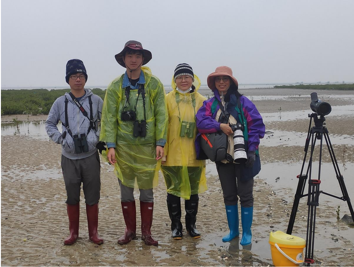
Survey team in Zhanjiang, 2023