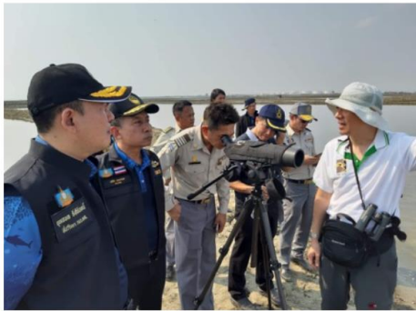
BCST welcoming a team from the Ministry of Environmental Resources