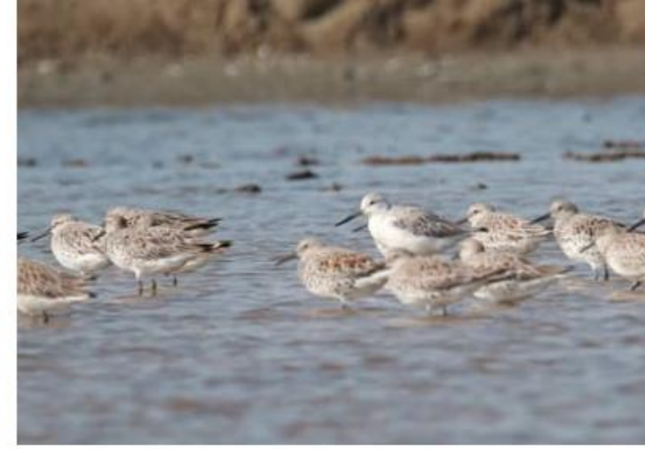
Nordmann's Greenshank & Great Knots at Pak Thale