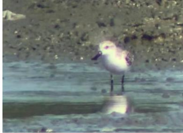
White P7 – wintering at Pak Thale

In September 2019, BCST has acquired the land of about 8 ha and established as Pak Thale Nature Reserve.