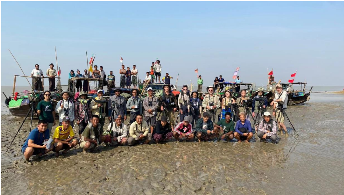
Winter survey in GoM, Myanmar ,2023