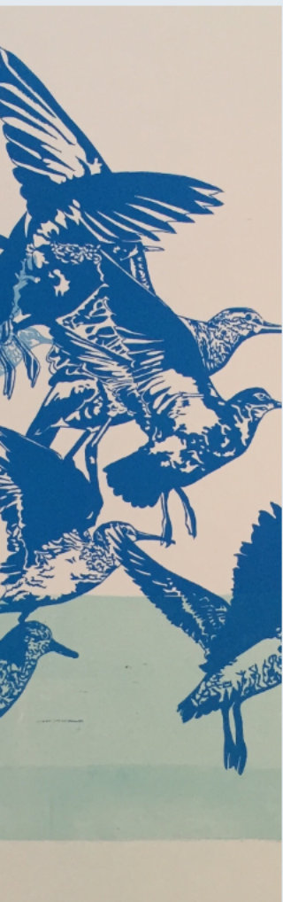
Existing Sister Site arrangements and other collaborative activities involving Network Sites in the EAAF