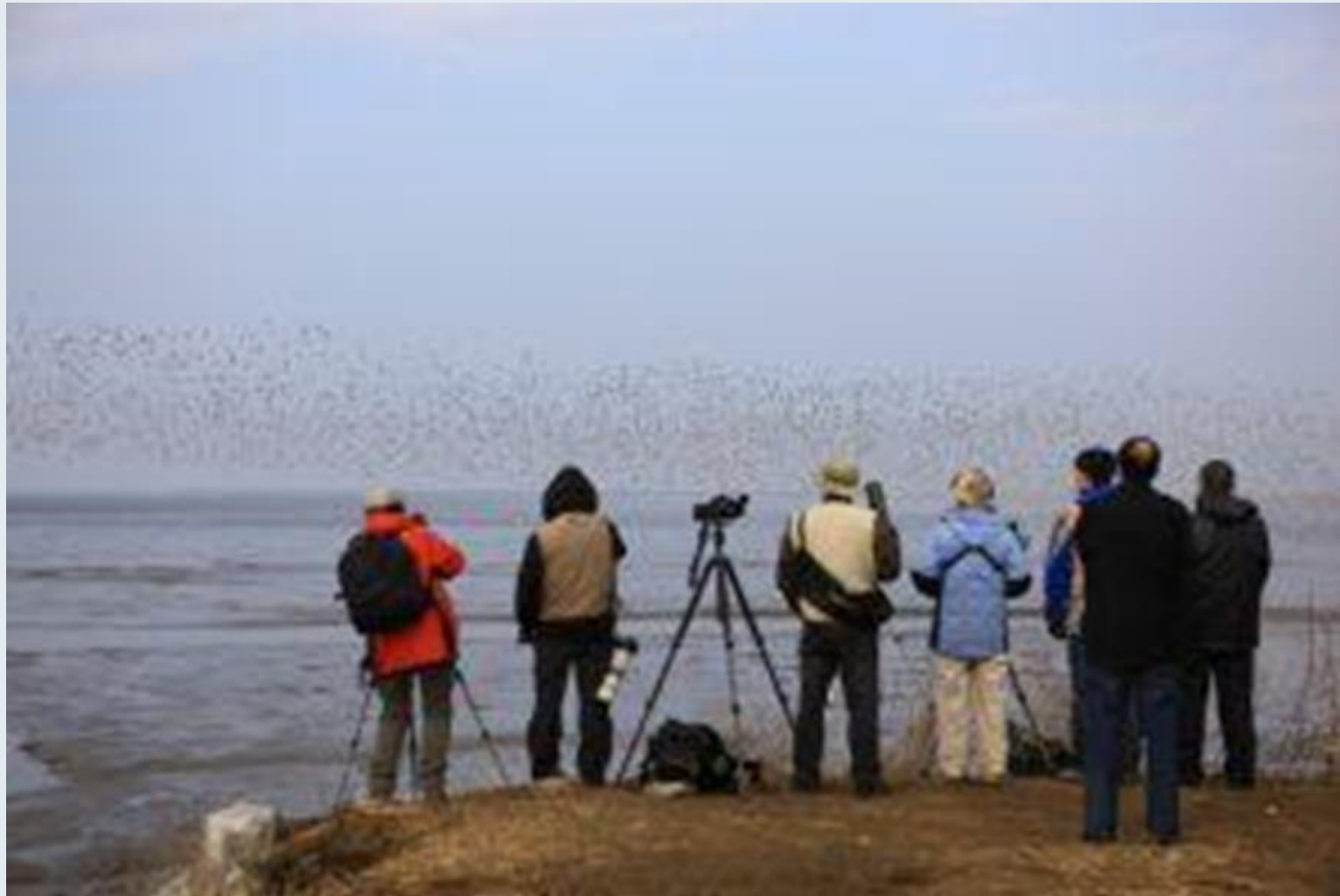
ELEVENTH MEETING OF PARTNERS TO THE PARTNERSHIP FOR EAST ASIAN – AUSTRALASIAN FLYWAY Meeanjin/Brisbane, Queensland, Australia, 12-17 March 2023