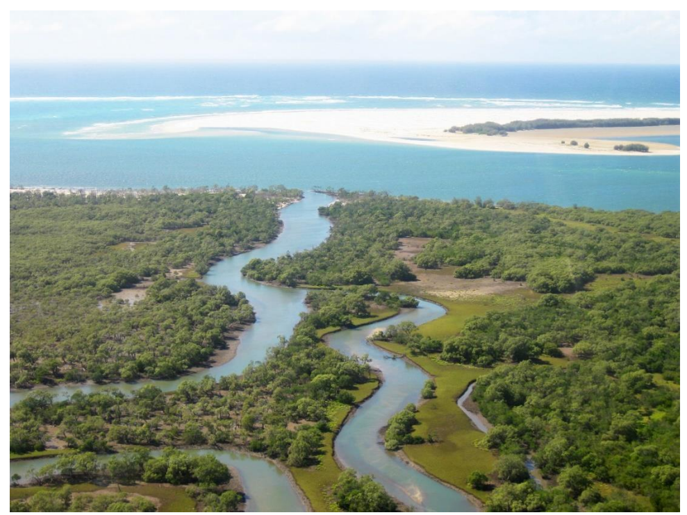
North Stradbroke Island

We look forward to seeing you on the day of the field trip and below you can find a schedule of activities for the day. Please note that we will need to closely keep to this schedule as we rely on multiple modes of transport for the day!