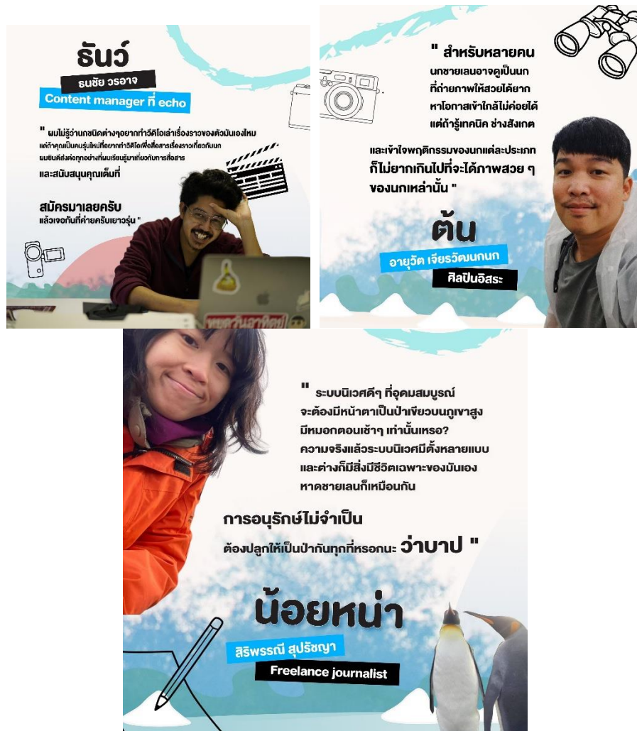
Figure 1 Promotion materials for application release on October 2021 and 3 professional mentors for the program.