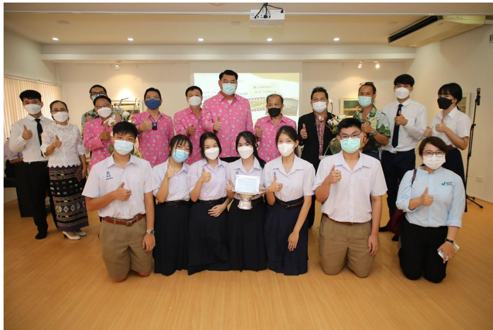
Figure 3 Photo exhibition banner and open ceremony on 5 Jul- 9 Sep 2022