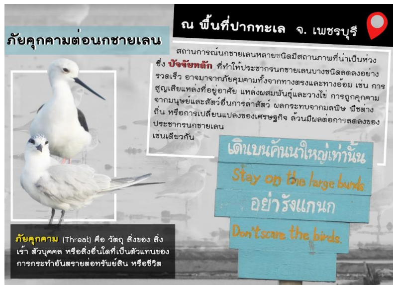
Figure 4 Journals with photos by young shorebird ambassador