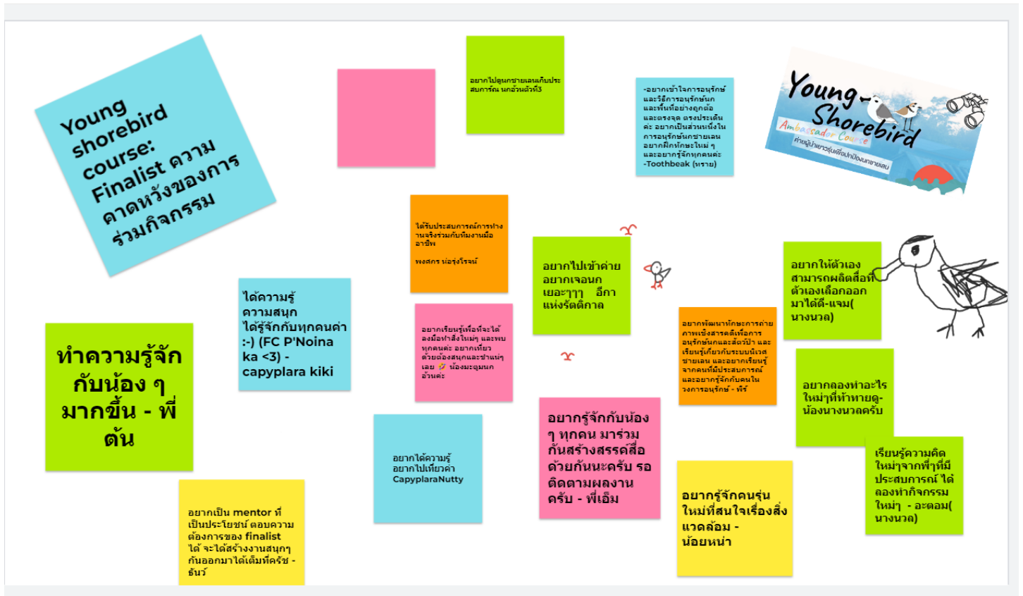
Figure 2 Activities of online training by Jamboard

The productions; 3 Thai articles were ready. Example of VDO production by young shorebird ambassador