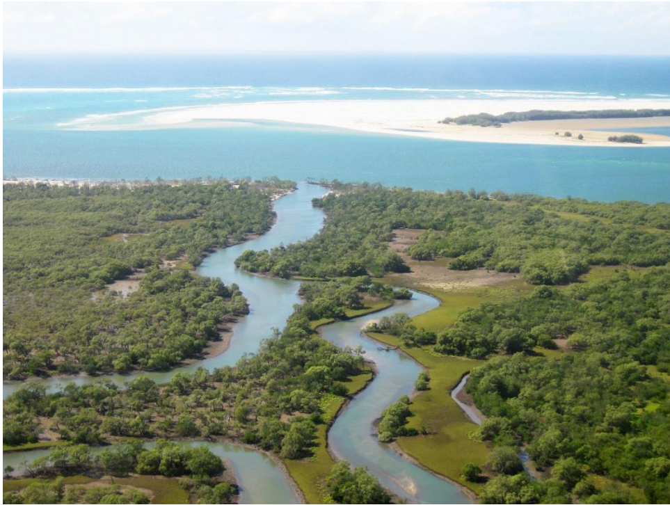
North Stradbroke Island

We look forward to seeing you on the day of the field trip and below you can find a schedule of activities for the day. Please note that we will need to closely keep to this schedule as we rely on multiple modes of transport for the day!