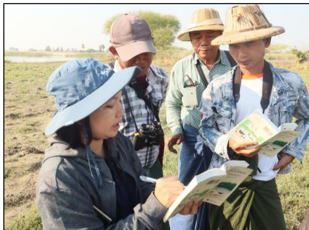
Fig – 7: Monitoring the migratory water bird survey at Pyu Lake

For Paleik Lake: surprised that the Paleik Lake have no more water because the sluice gates were opened in the late rainy season by the water committee. The committee have comprised with the local farmers to form the Water Users Group for the irrigation system from the Myitnge River to Paleik Lake. In flooding the rainy season, the committee were not opened the sluice gates. Because the committee respected some of the farmers who were the last to plant rice crops and harvested their crops lately. When they opened the gates, the inflow of Myitnge River was low. Therefore, we have no more recorded the water bird species in Paleik Lake. Currently, the water committee have got the water for their cultivation from the Myit River irrigation of the Water Resources Department.