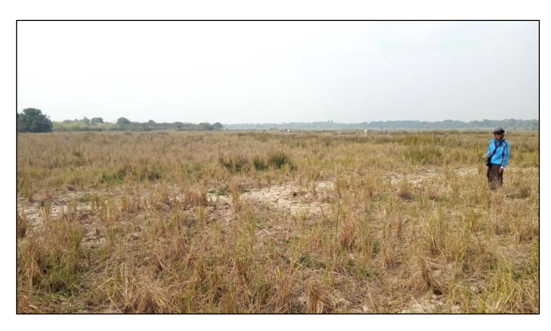
Fig – 8: Habitat threats of Paleik Lake