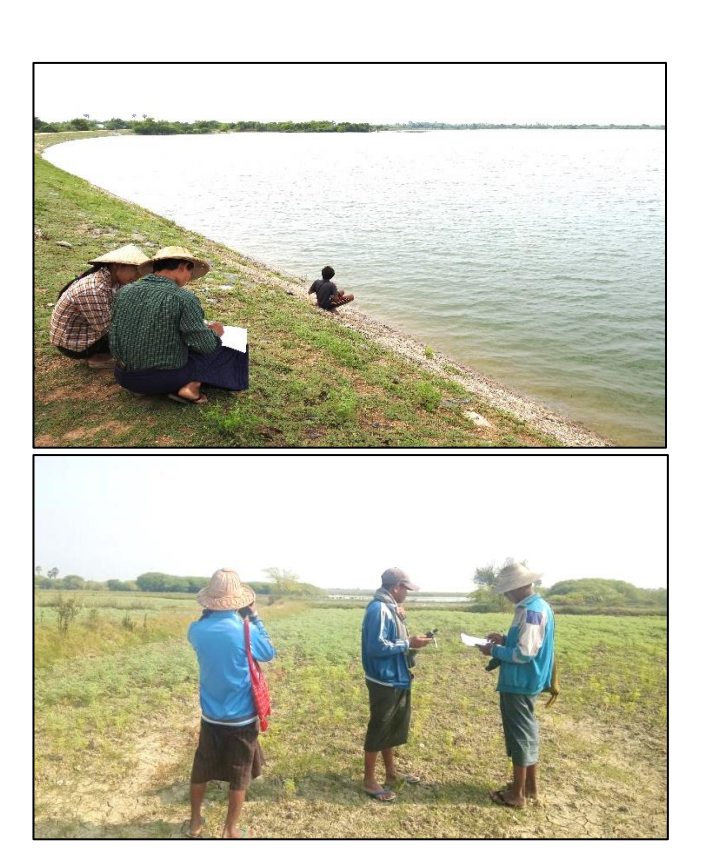
Fig – 5: Photos of hunting assessment and SMART patrolling training and practical survey

Moreover, we provided the news two binoculars of Nikon Prostaff 7 S (8* 42) brand and bird watching training to five members of CBO (SKNCA) in January 2023. We organized the Asian Water Bird Census (AWC – 2023) on 23<sup>rd</sup> January at the Pyu Lake and Banaw Inn (Latttaung Inn) are priority wintering sites for Baer's Pochard in Mandalay region with the trainees and some interested bird watchers. Then, we monitored the Baer's Pochard and other migratory water bird and facing the wetland habitat threats survey with the CBO members at the Pyu Lake, Paleik Lake and Banaw Inn in January.