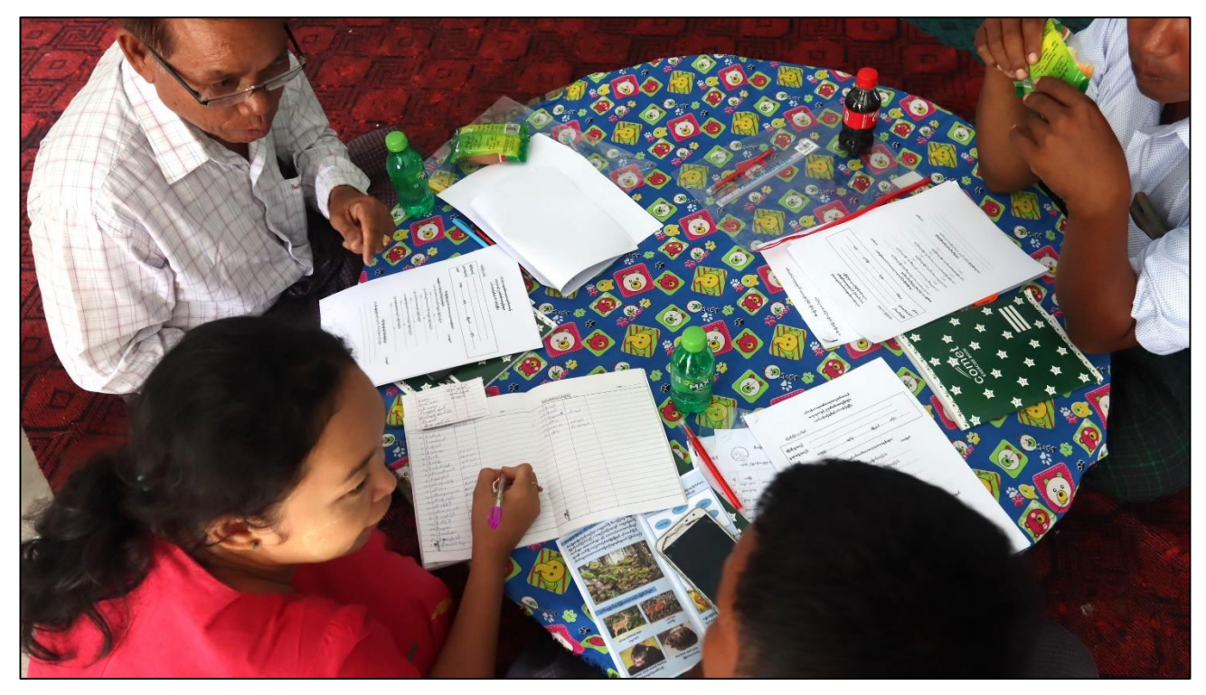
Fig - 3: Administrative and financial management training photos

On 16<sup>th</sup> to 20<sup>th</sup> June, the two members who are selected the trainees joined in with the BANCA performing the education awareness programs at the seven villages namely Pyu village, Taung kan village, Kyauk kan village, Moe nan chon village, Myin thae village, Ywar taw lay village and Yae ka moe village are irrigated villages of Pyu Lake for raising knowledge about the value of inland wetland services and wetland conservation to humans and migratory water birds. To more understand that designation the conservation sites such as Ramsar and Flyway Network Site are highly productivity their livelihoods and more involve with the long term of inland wetland conservation programs in Mandalay region.