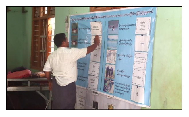
Fig – 2: Group work and dialogue practice photos

Furthermore, we trained the four members about the administrative and organization procedure training on 12<sup>nd</sup> to 13<sup>rd</sup> June. The purpose is to know the roles of organization procedure for implementation the project activities to reach the goal of Shwe Kantharyar Nature Conservation Association in the conservation of water bird species and inland wetland activities and to learn how to put into the effect of concept and activities with the systematic way. We published the documents to trainees, shared the experiences with examples and put their ideas/ plans into practices. Mainly lectures are preparation the incoming and outgoing letter and organization structure and its rules, maintenance the equipment inventory list, forecasting the monthly activities, recording the visitor list and project lists and reporting the petty cast (withdraw and expenditure cost) in two days training. After the training, they could report to registration department about their yearly activities in January 2023 and will prepare the permission letter to general administrative department for supporting the wetland and it biodiversity conservation training to other LCG namely Paleik Lake Nature Conservation Association in Singaing Township in February 2023 by the small grant of WWF – Myanmar.