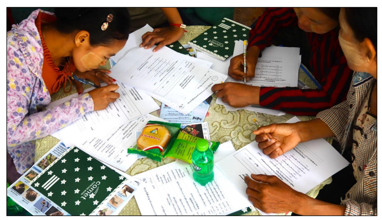
Fig -1: Activities photos of inland and its biodiversity conservation training

The seventeen members actively participated the CEPA and coaching training on 12<sup>nd</sup> to 15<sup>th</sup> June, 2022 by way of practical and power point presentation. Before and after the training, they took a pre