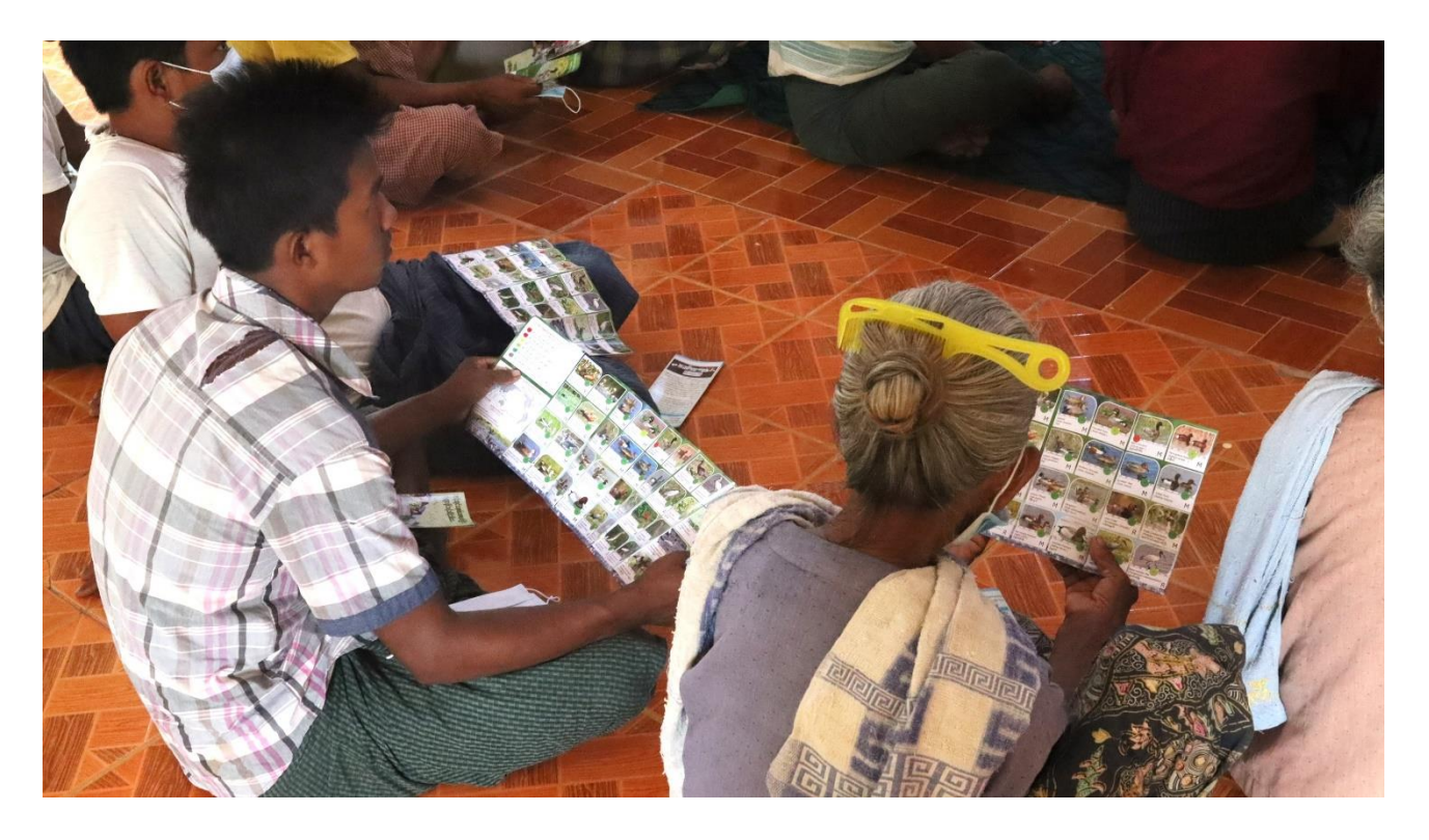
Fig – 4: Photos of awareness activities in six villages near the Pyu Lake

In October, we trained the SMART patrolling and hunting assessment training to seven members from CBO (SKNCA) for monitoring the current threats and changes to wetland and its environs and exploring the status of bird hunting at villages and selling in market near the Pyu Lake and Paleik Lake. After the training, the trainees have monitored the patrolling and hunting assessment at market and pagoda in wintering season in Tada Oo township near the Pyu Lake and Singaing township near the Paleik Lake by the WWF – Myanmar project, 2022.