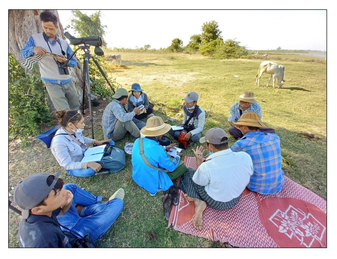
Fig – 6: Activity photos of Asian Water Bird Census at Pyu Lake and Banaw Inn

For Pyu Lake: noted that the water level of Pyu Lake is up to 12 feet in January due to the King Dar Dam's water supply and the villages near the Pyu Lake have enough got the water for their agriculture. Because of the high level of water, many migratory water bird species have not come to migrate yet in Pyu Lake. Recently, we used the core count methods and recorded the 960 individuals of 26 water bird species in Pyu Lake. If possible, the Baer's Pochard and other migratory water bird species will migrate in abundance in February because the water level of Pyu Lake will less than 9 feet and some of the flooded wetland will be extraction the water and changed to farmland.