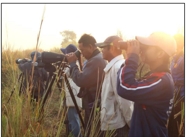
Fig – 9: Migratory water bird survey activities at Banaw Inn (Lattaung Inn)

All in all, we will conduct the survey for Baer's Pochard and other migratory water bird and standing the awareness signboard about the impact of migratory bird consumption in mid of February. It is timing to survey and share the awareness messages to local communities because the migratory water bird species will be crowded at the left water areas.