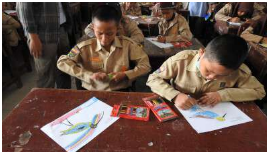
Students during the art-drawing competition

At least 180 students and 19 teachers from Medang Deras Sub-regency and Lima Puluh Pesisir Sub-regency joined the activities through the event held on 27 – 28 May 2022. The activities included storytelling to “Introduction the migratory shorebirds”, drawing competition for 134 students, photo exhibition and short film screening “Migratory Shorebirds in Batubara coastline”. The event began with an opening speech from WHIS and the head of the elementary school. WHIS conveyed that the purpose of this event was to raise awareness and educate elementary school children and teachers regarding the importance of their location as a stopover for migratory shorebirds in North Sumatra. So, together, we must protect these migratory shorebirds from hunting.