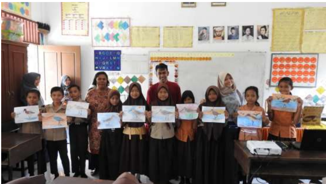
Group photo with students during art-drawing competition

The eastern coast of North Sumatra, Indonesia, is one of the most important wintering and stopover grounds for some of the migratory shorebird populations on the East Asian-Australasian flyway. One site is on the east coast of Batubara regency is an important site for Nordmann's Greenshank, Great Knot, Far Eastern Curlew, Asian Dowitcher, Curlew Sandpiper, Bar-tailed Godwit, and other shorebirds.. However, limited information and knowledge about migratory shorebirds in the area hinder the conservation to tackle the threats to migratory shorebirds, such as hunting. Therefore, the Wild Heritage of Sumatra Foundation (WHIS) which pays attention in-depth study and conservation of migratory shorebirds in the east coast of North Sumatra, especially in Batubara Coastline, conducted education programme to three elementary school students on the east coast of Batubara Regency, i.e UPTD SDN 06 Durian Village and UPTD SDN 18 Lalang Village Medang Deras sub-regency and UPTD SDN 16 Gambus Laut Village, Lima Puluh Pesisir sub-regency, in line with the World Migratory Bird Day.