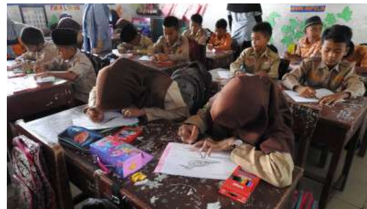
Students participating in the art-drawing competition

In the future, WHIS will try to carry out similar activities to two other elementary schools, which are also located on the east coast of Batubara Regency. The targeted schools are schools that are included in the landscape plan for the conservation of migratory shorebirds on the east coast of the Batubara regency. These schools are in the villages of Durian, Pematang Nibung, Medang, Lalang, Gambus Laut and Perupuk. The students who took part in this activity were very enthusiastic, they listened and asked questions about migratory shorebirds. This activity was the first time for them, so they were very happy to participate in the whole series of events. They hope that activities like this will be held every year in their schools. It's hoped that with this initial activity, the young generation on the east coast of Batu Bara Regency can recognize migratory shorebirds and become future conservation cadres.