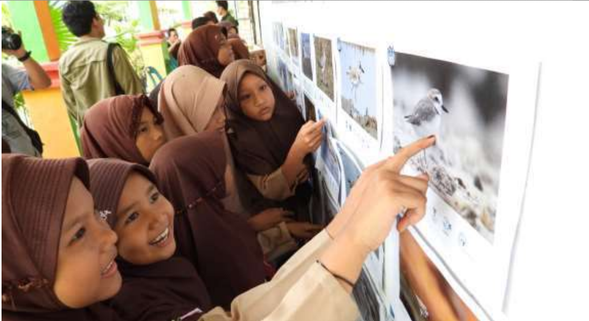
Students look at photos and memorize the names of migratory shorebirds