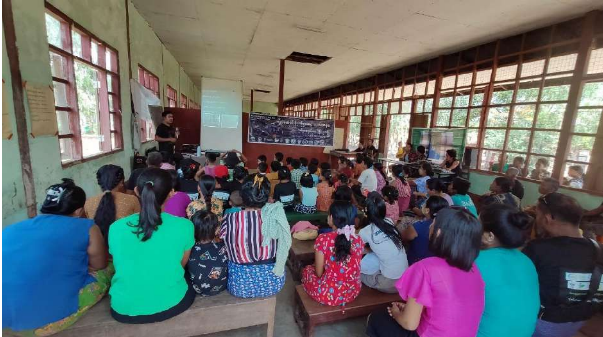
Photo 5: Presentation on the conservation of migratory birds and wetlands