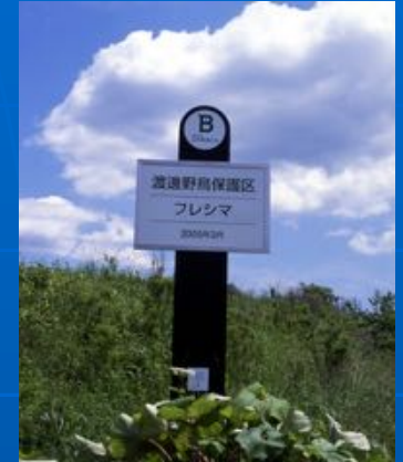
Nature reserve in Hokkaido