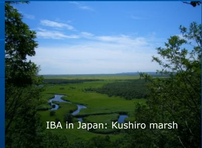
IBA in Japan: Kushiro marsh