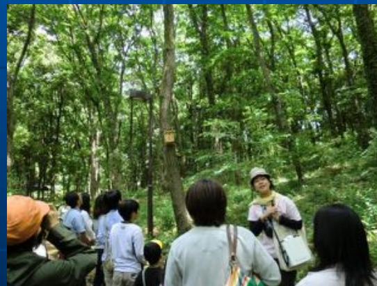
Bird watching excursion