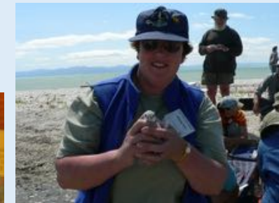
Field training courses