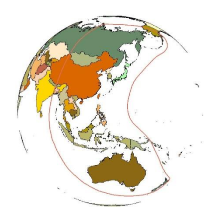
Map of the East Asian – Australasian Flyway