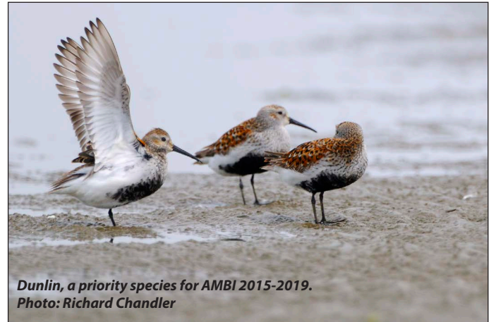
Dunlin, a priority species for AMBI 2015-2019.

Prevent illegal harvest and regulate unsustainable legal harvest of Arctic migratory birds, with a focus on Spoon-billed Sandpiper, Lesser White-fronted Goose, Bar-tailed Godwit, and other priority species