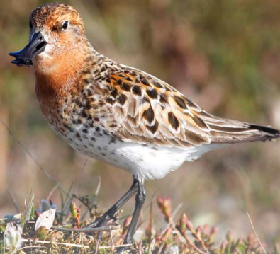
Spoon-billed Sandpiper, a priority species for AMBI 2015-2019.