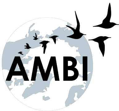
Arctic Migratory Birds Initiative